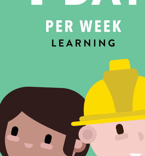
LEARN ALONGSIDE EXPERIENCED COLLEAGUES