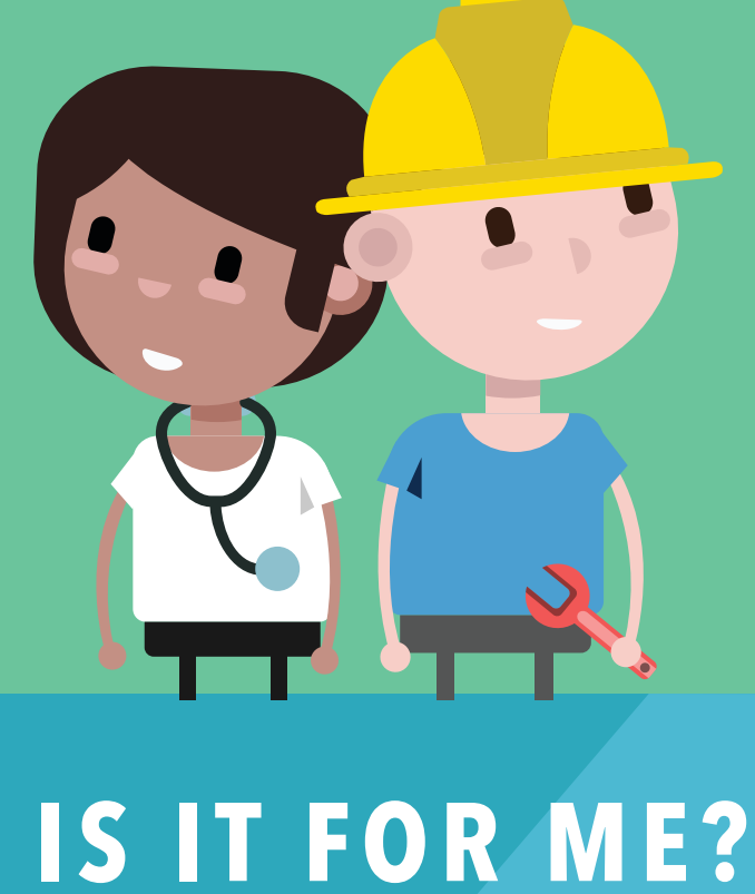
OF JOB ROLES WITH MANY MORE TO COME