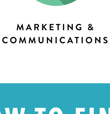
HOW TO FIND HIGHER APPRENTICESHIPS